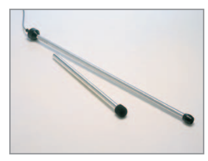
A standard probe for adult testing and a calibration tube are included with the RhinoScan softare.

The standard nose adapters are tailored to fit right and left nostrils, with a pleasant, non-slip surface that is anatomically designed to offer maximum patient comfort and a perfect fit. These units can also be used with the RhinoStream module. Applying sealing gel avoids sound leaks between the adapter and the nostril.